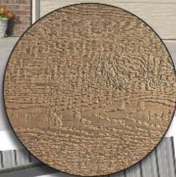
Model 31 Detail